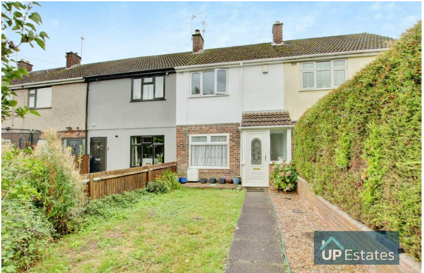
Diana Drive, Coventry